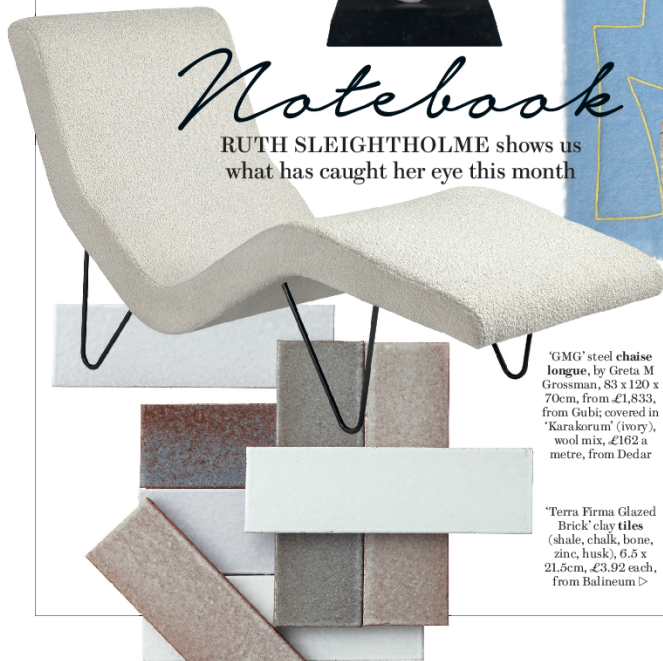
'GMG' steel chaise longue, by Greta M. Grossman, 83 x 120 x 70cm, from £1,833, from Gubi; covered in 'Karakorum' (ivory), wool mix, £162 a metre, from Dedar