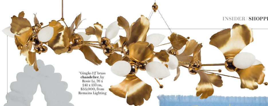
'Ginkgo 12' brass chandelier, by Rosie Li, 76 x 241 x 137cm, $35,000, from Remains Lighting